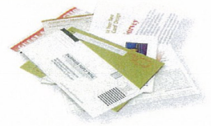
Junk Mail, Phone Books & Office Paper