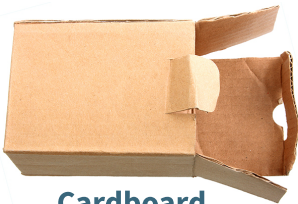
Cardboard (Please Flatten!)

All recyclables MUST be inside the cart, with the lid closed!