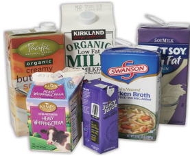
Beverage & Food Cartons