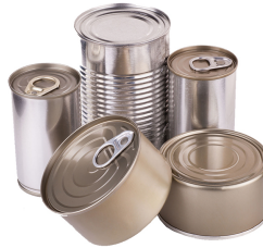
Aluminum & Steel Cans, Aluminum Foil & Pie Tins