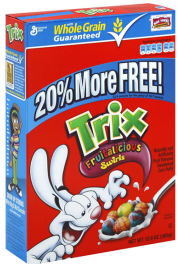
Paperboard (Cereal Boxes, Paper Towel Rolls, Brown Paper Bags, etc.)