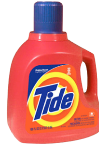
Plastic Containers Nos. 1-7