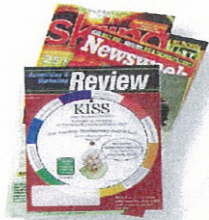
Magazines, Newspapers & Inserts